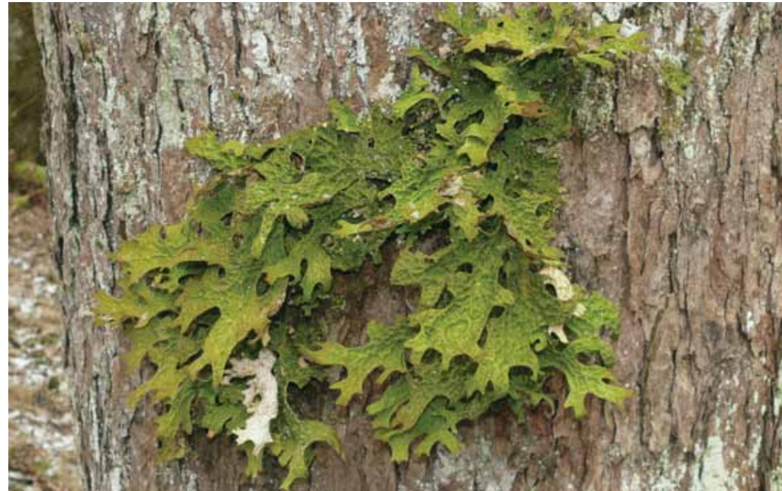
Lobaria pulmonaria. This species of lichen could spread if more of the Lake District were rewilded.